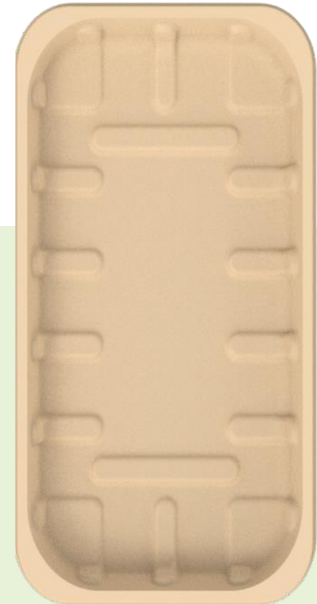
Molded Fiber Meat Trays