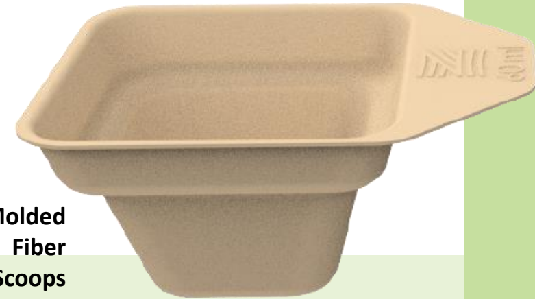
Molded Fiber Scoops

MULTINATIONAL FOOD & BEVERAGE CONGLOMERATE ("F&B CPG")